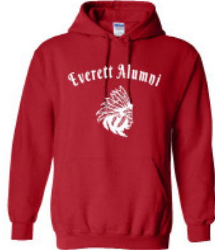
Hooded Sweatshirt $18.00

Add an additional $2.00 for 2XL and 3XL sizes