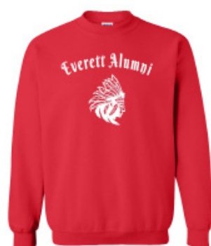
Crewneck Sweatshirt $16.00