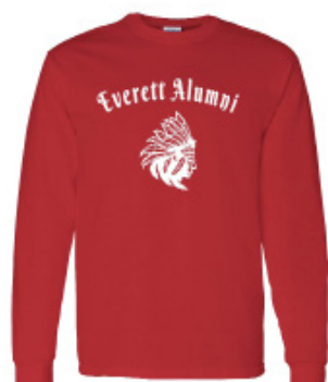
Long Sleeve T-shirt $12.00