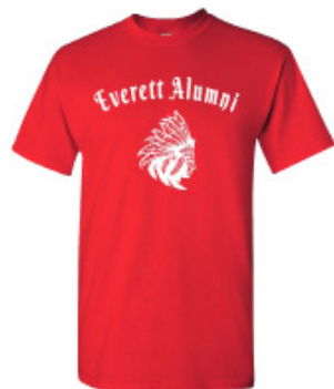
Short Sleeve T-shirt $10.00