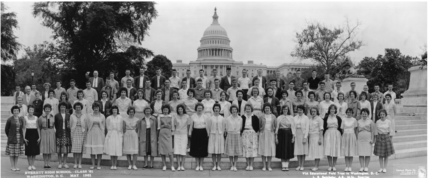
Everett High School Class of 1961 Senior Trip to Washington D.C. - MAY 1961