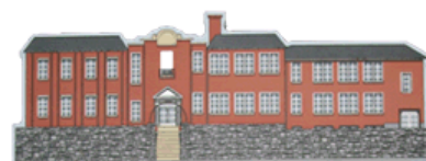
6" x 5.25" x .75"

To order your replicas, please use the enclosed form and mail along with your payment to: