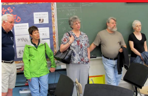
◀ Class of 1966 tours the High School;