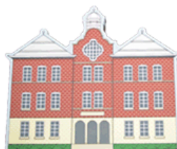
9" x 3.25" x .75"

The Association has colorful, wooden replicas of the two former North Spring Street school buildings available for you to purchase. The history of each building is printed on the backside. You can obtain each building for $20.00 or the set for $35.00. We can mail a single replica to you for $4.00 or the set for $7.00.